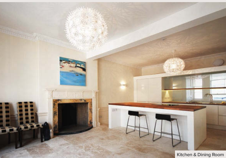
Kitchen & Dining Room

The property offers a fully relaxed vacation experience; with four bedrooms (two with ensuite bathrooms), shower room, formal drawing room, relaxed family sitting room and a large dining kitchen there is something to suit everyone.