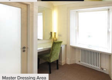
Master Dressing Area